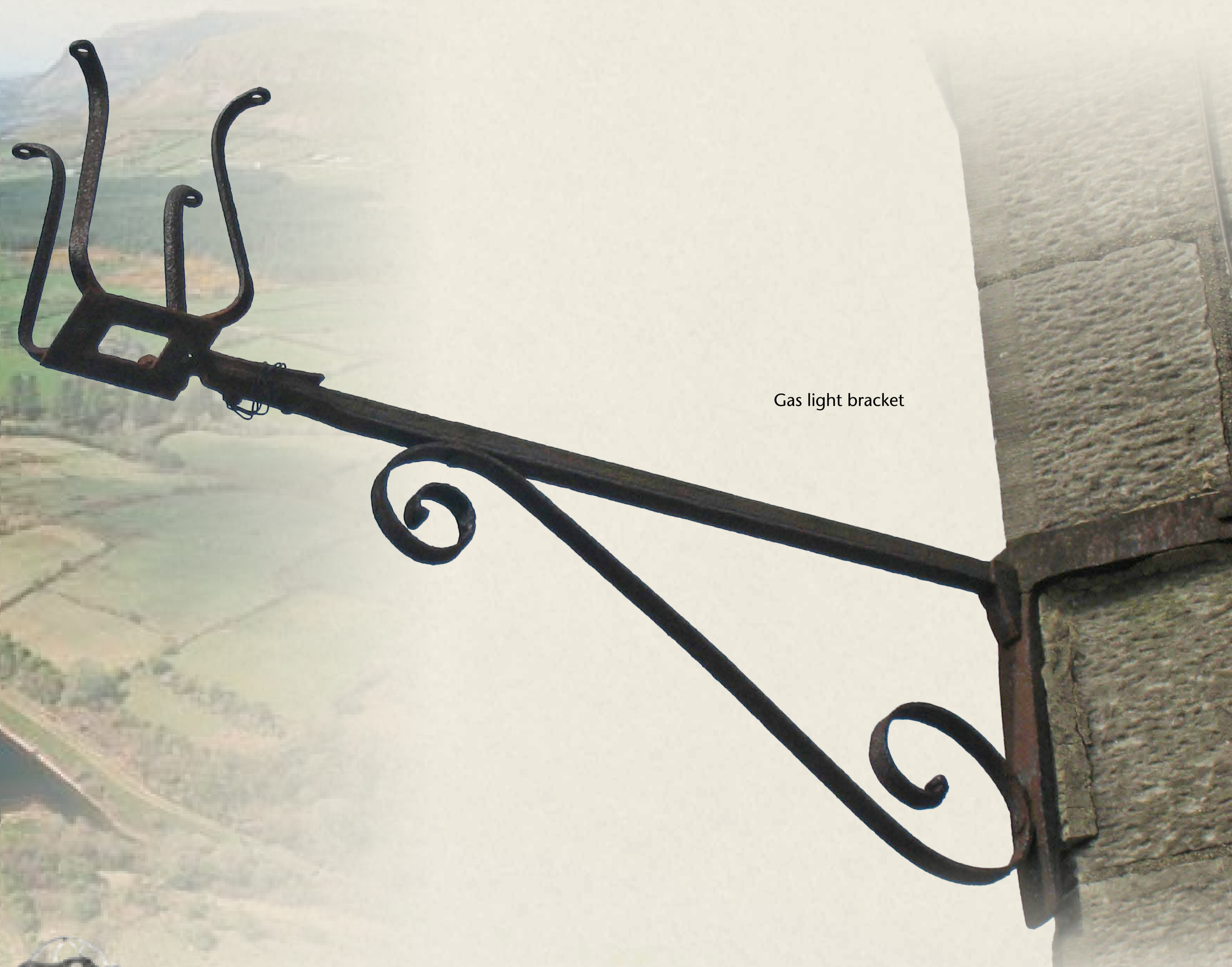
Gas light bracket