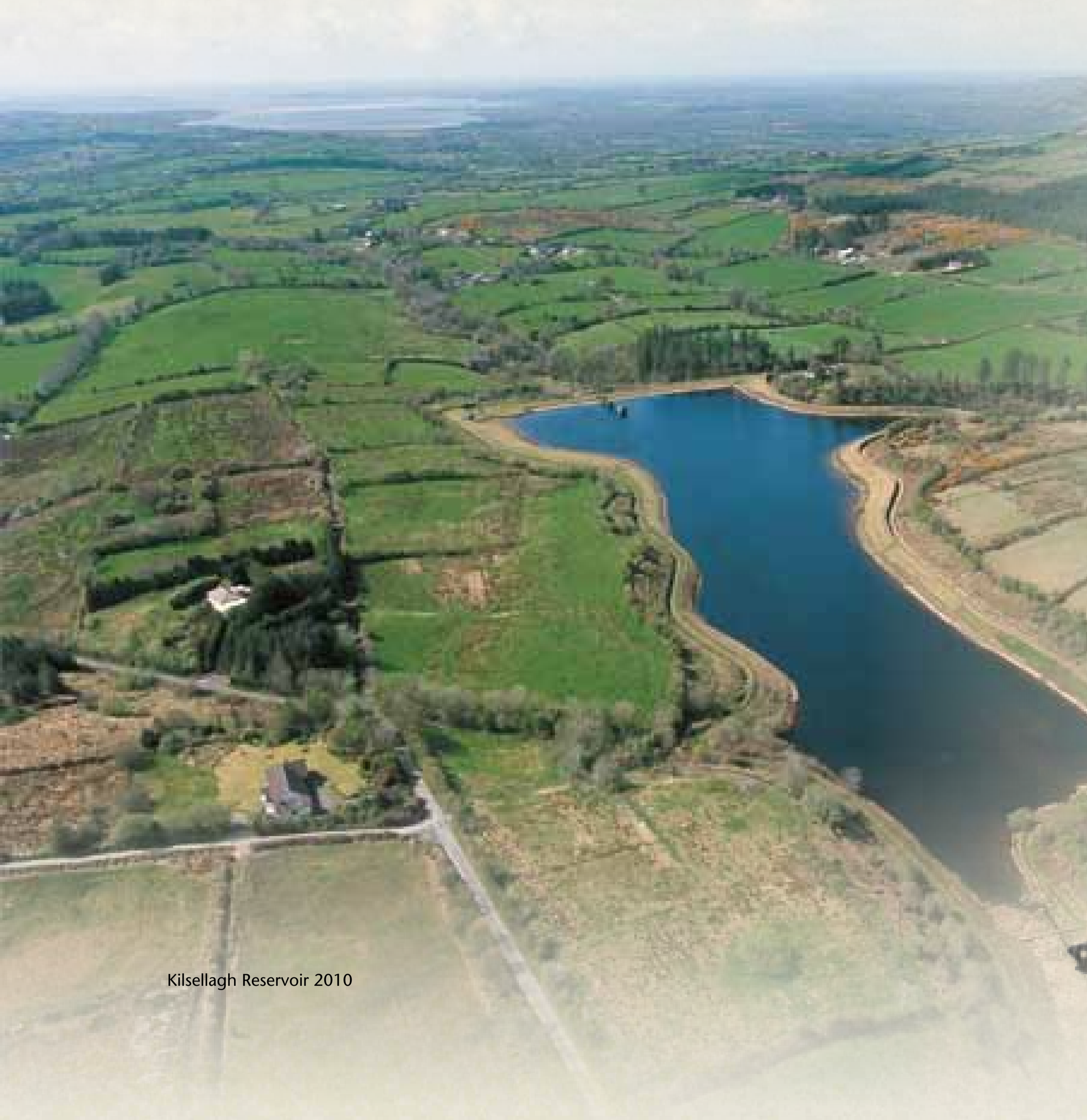
Kilsellagh Reservoir 2010