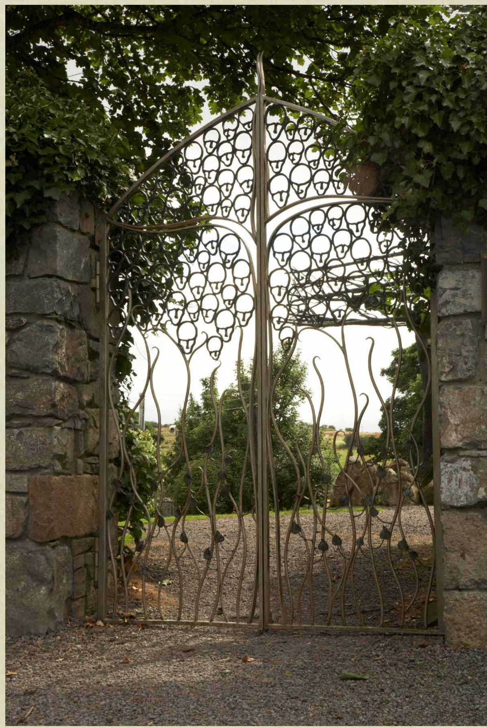
Gates commemorating the Famine at the site of the former Workhouse

Sligo's poor had suffered a number of fevers and famines in the early part of the 19th century. In 1841 the Workhouse was built to accommodate 772 inmates, but during the potato famine of 1845-1850 over 4,175 were in residence. Three auxiliary houses had to be opened; whole families, old people and young children are recorded in its register. Between November 1841 and December 1850 a total of 31,021 inmates were admitted to the work house at Ballytivnan, 25,321 were discharged and 2530 died. Most of the dead were buried in the small famine graveyard, which is now appropriately marked by the "Faoin Sceach" memorial and the gates that lead from St. Joseph's church car park.